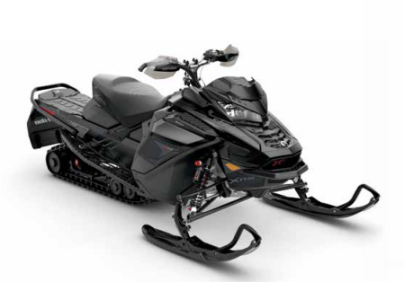
Renegade® X-RS® 900 ACE™ TURBO shown