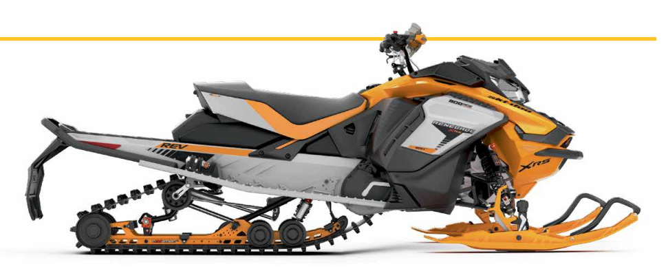
Renegade® X-RS® 900 ACE™ TURBO with Adjustable Package shown