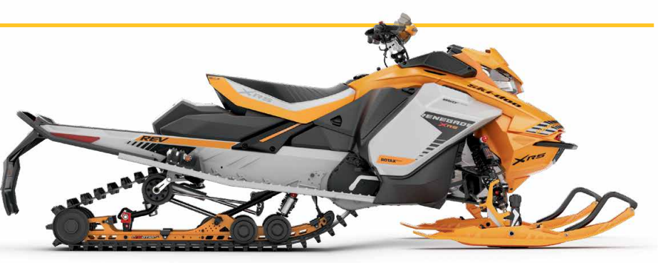
Renegade® X-RS® 850 E-TEC® with Adjustable Package shown