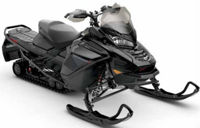
Renegade® X 900 ACE™ TURBO shown