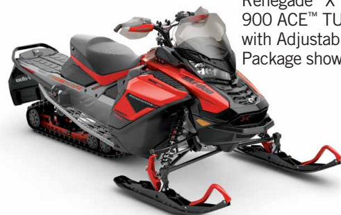
Renegade® X 900 ACE™ TURBO with Adjustable Package shown