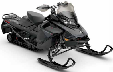
Renegade® X 600R E-TEC® shown