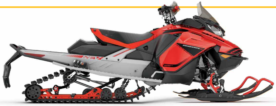
Renegade® X 850 E-TEC® with Adjustable Package shown