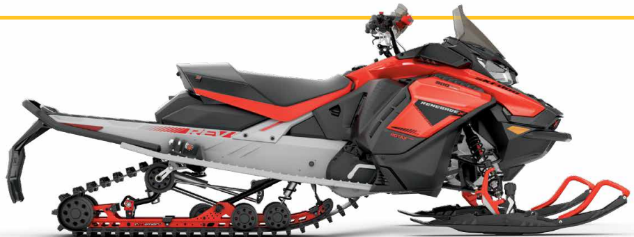
Renegade® X 900 ACE™ TURBO with Adjustable Package shown