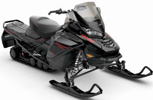
Renegade® ENDURO 900 ACE™ TURBO shown