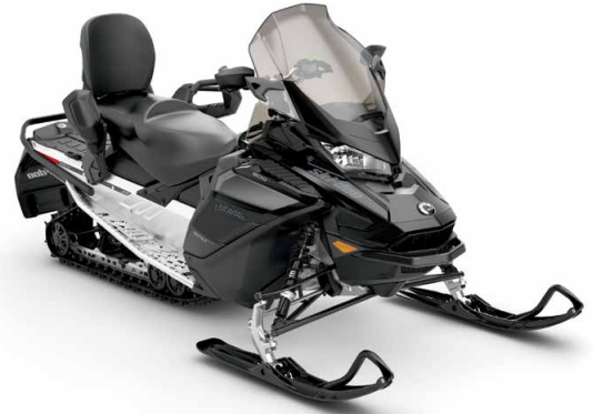
GRAND TOURING SPORT 900 ACE™ shown