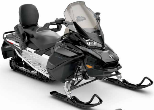
GRAND TOURING SPORT 900 ACE™ shown