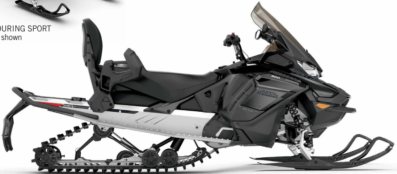
GRAND TOURING SPORT 900 ACE™ shown