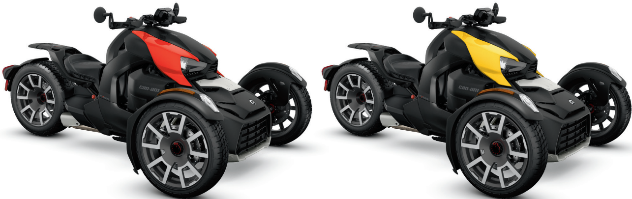
Units shown with Classic Series panel kits.