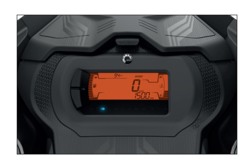
4.5-in. digital display

Easily remove or install the passenger backrest and handholds with the LinQ system.