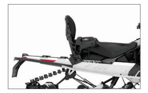
2-up seat with removable LinQ passenger backrest and handholds

Sculpted to offer improved rider and passenger wind deflection.