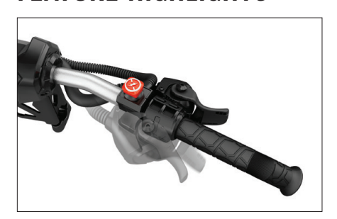
Finger throttle position

Throttle block can be rotated to be used as either a traditional thumb throttle or unique finger throttle.