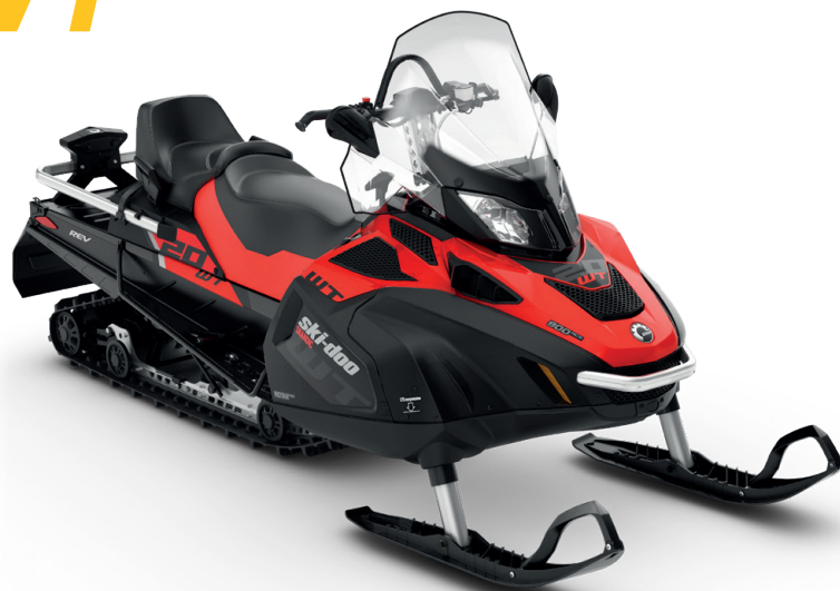
SKANDIC® WT 900 ACE™ shown