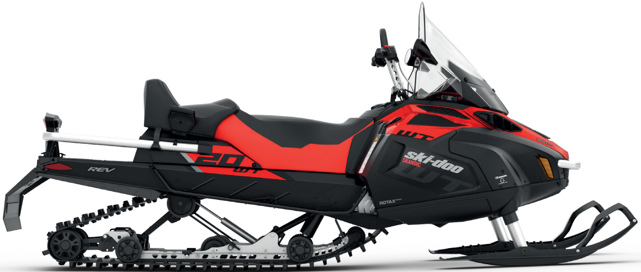
SKANDIC® WT 900 ACE™ shown