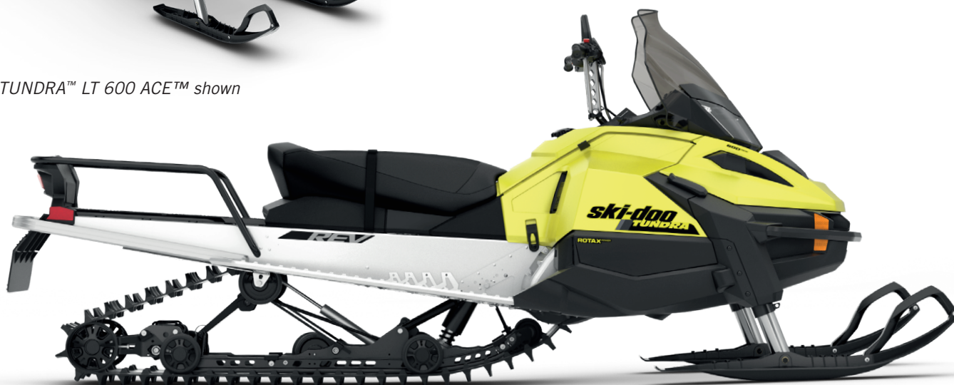
TUNDRA™ LT 600 ACE™ shown