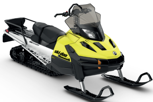
TUNDRA™ LT 600 ACE™ shown