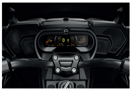
BRP AUDIO PREMIUM

LINQ COMPATIBLE TOP CASE Removable watertight top case provides 60L /15 gal. of storage, making it perfect for not leaving anything behind on a long distance ride.