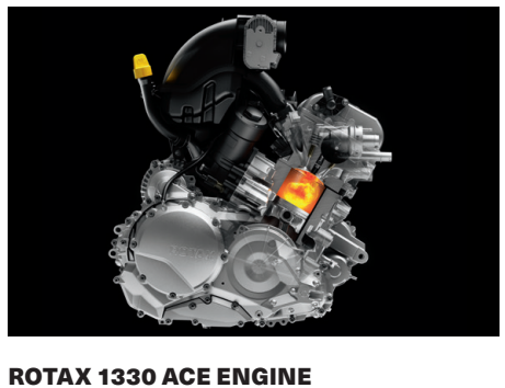
the road knowing you have the horsepower you want when you need it.

SELF-LEVELING AIR SUSPENSION Rear air shocks automatically adjust to passenger and cargo weight to ensure comfort is never compromised.