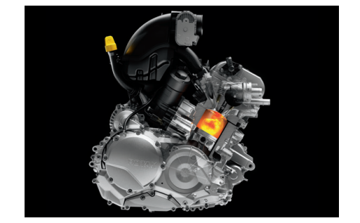
ROTAX 1330 ACE ENGINE 115 hp engine – More power can only mean one thing – better performance. Our most powerful engine allows you to challenge the road knowing you have the horsepower