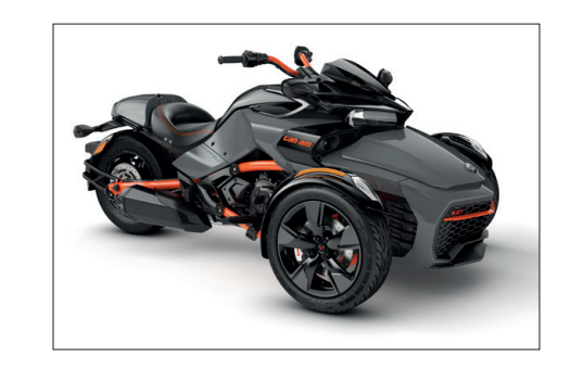
SPECIAL SERIES A special package for the sport enthusiasts that comes pre-equipped with several accessories.