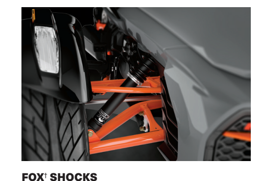
Sport-tuned, gas-charged front shocks give you a responsive, sporty feel and great performance on the most demanding roads.