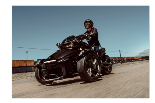
Vehicle Stability System that uses a variety of technologies, including SCS / ABS / TCS, to monitor the vehicle and keep the rider confident on the road.