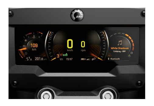
DIGITAL GAUGE Large panoramic 7.8" wide LCD color display on Special Series.