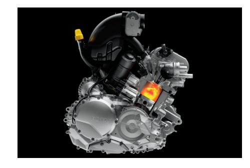
ROTAX 1330 ACE ENGINE 105 HP engine - Power meets efficiency. Hit the road knowing you've got a proven engine that will go the distance.

Vehicle Stability System that uses a variety of technologies, including SCS / ABS / TCS, to monitor the vehicle and keep the rider confident on the road.