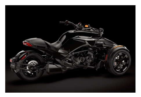
Y ARCHITECTURE Two wheels in front means better handling and enhanced stability.