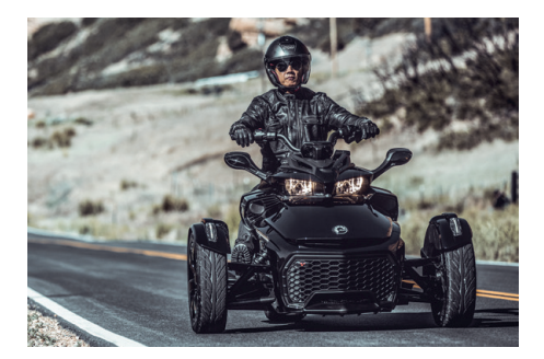
SEMI-AUTOMATIC TRANSMISSION Shift through gears easily with the touch of a button.