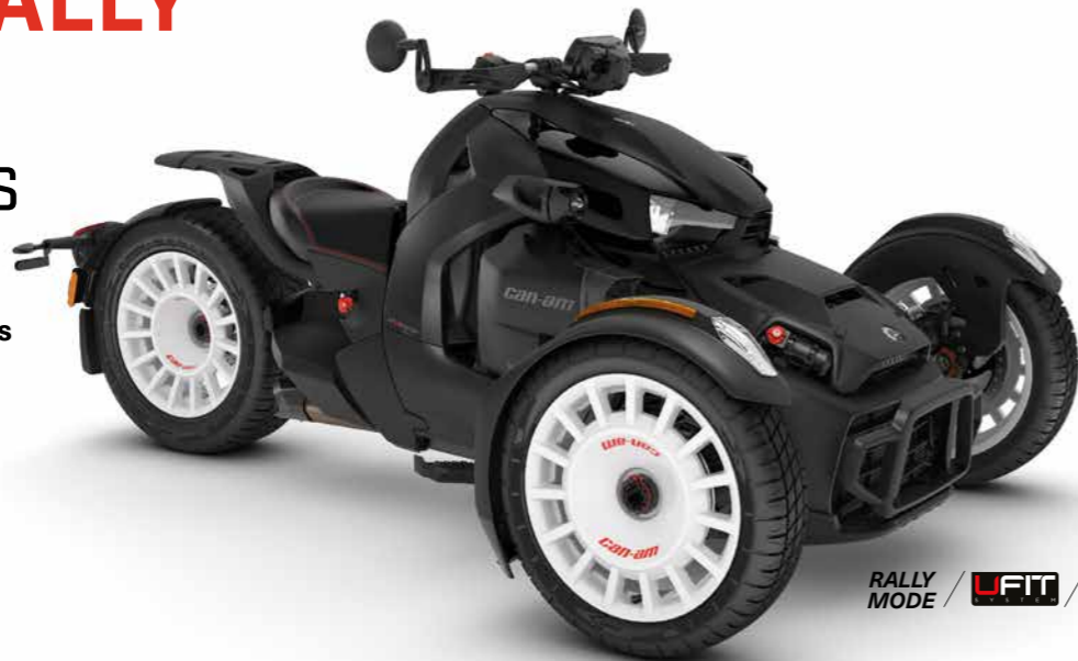
SHOWN WITH INTENSE BLACK PANELS