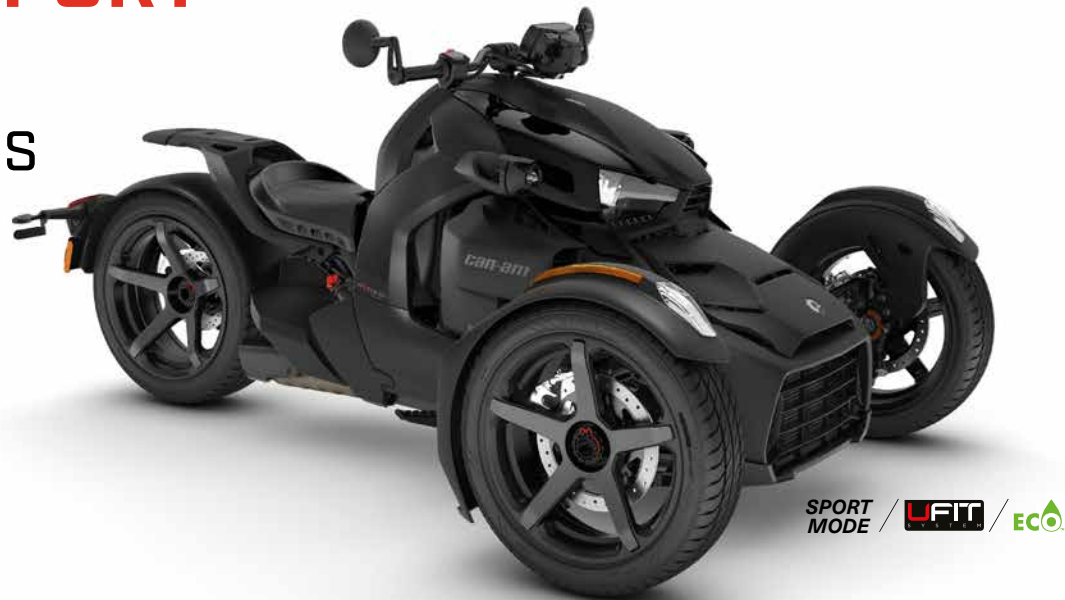
SHOWN WITH INTENSE BLACK PANELS