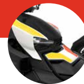
Heritage White IV