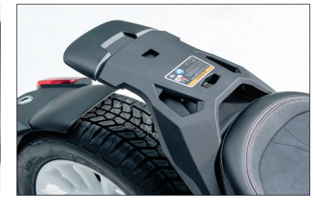
MAX MOUNT STRUCTURE

Front and rear KYB HPG shocks with remote adjusters and 1 inch of extra suspension travel to optimize your ride and improve comfort.