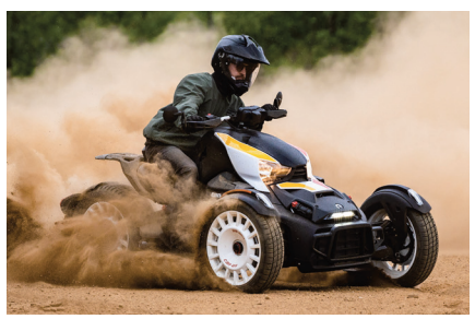
UNIQUE RALLY EXPERIENCE

Get extra protection for higher durability with front vehicle protection, aluminum skid plate under the vehicle and reinforced rims.