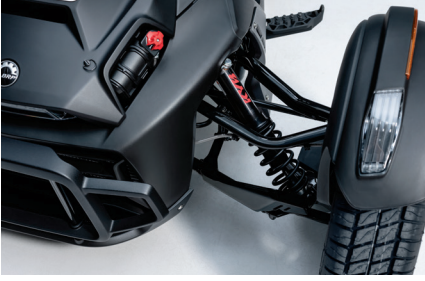
FULL KYB HPG SHOCKS

Unique sound signature and high-end exhaust.